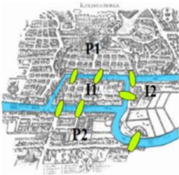
(a) Seven bridges